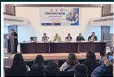
AICTE Sponsored FDP on Photography