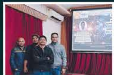
Seminar on Machine Learning