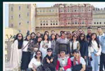
Educational Tour Department of Economics