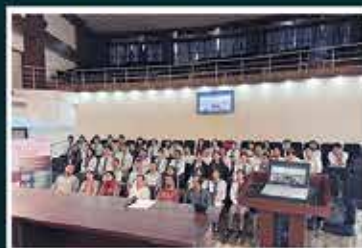
National Science Day 2025 Department of Physics